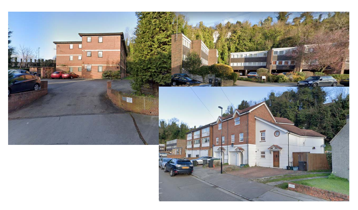
Figure 4 The surroundings areas character (137 – 165 Montpelier Road – top left, Dell House – top right and Cliff House/30/30a and 30b Biddulph Road – bottom right).

8.18. Unlike the majority of examples seen throughout the wider streetscene, hard standing will not dominate the proposed scheme with the building set back by 2.50 metres at its closest point on the corner between Biddulph Road and Hailing Down Passage and then steeping back to 5.70 metres adjacent to 30b Biddulph Road to meet the building line seen within this stretch of the road. This setback allows for soft landscaping (with indicative replacement tree planting highlighted) and the two level access street facing entrances to the proposed two cores. On-site parking would instead be provided at ground floor level utilsing the land levels to the rear and excavating accordingly. This parking space would then be topped with a podium and landscaped to provide additional communal/child play space, which would be accessible directly of the main core as well as externally from the ground floor amenity spaces seen within figure 5. Overall it is considered that the proposed development site layout, mass, height and scale respond to the evolving context of the area, whilst making the most efficient use of the land in line with guidance set out by the CLP 2018 and the SDG.