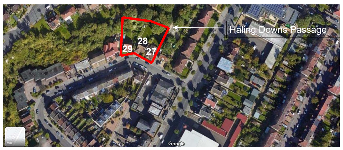
Figure 1 Birds eye view of the site and its surroundings