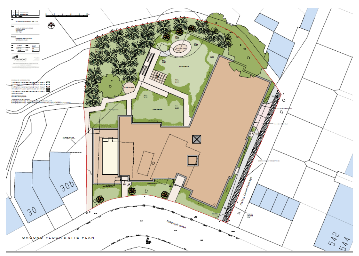
Figure 7 Relationship with neighbouring properties

8.31. The properties most affected by the development would be the immediate neighbours (24 – 26 and 30b Biddulph Road, the properties fronting Brighton Road to the east and to the rear 47/49/49/51/53 Kingsdown Avenue).