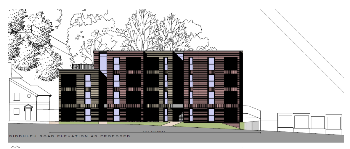
Figure 3 – Proposed Front Elevation onto Biddulp Road

8.21. Therefore, having considered all of the above, against the backdrop of housing need, officers are of the opinion that the proposed development that would