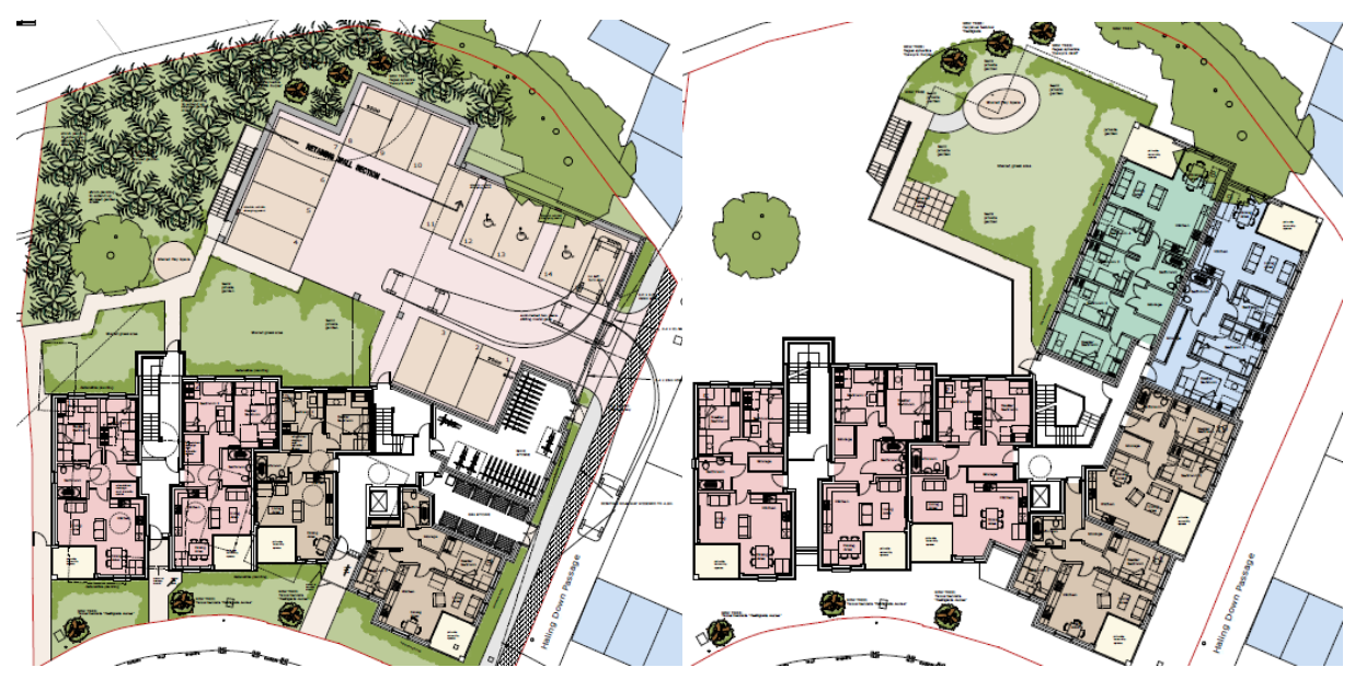
Figure 5 Site/Ground Floor Plan (left) and First Floor Plan (right)