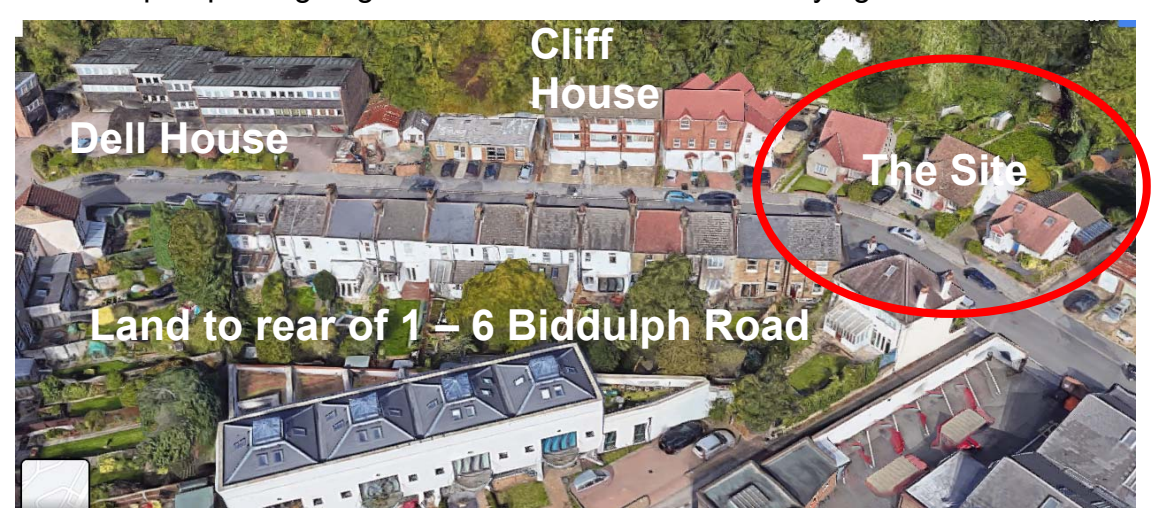
Figure 2 Site and the surroundings