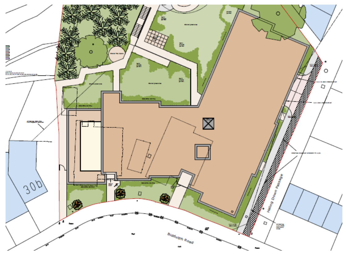
Figure 3 Proposed Block Plan

8.16. As figure 2 indicates Biddulph Road, is not defined by one particular form of development with in-fill flatted blocks with flat roofs (Dell House) located on the adjacent curve of Biddulph Road, shallow pitched roofs such as those found on Cliff House as well as the crown roofs found on the backland development situated behind 1 – 26 Biddulph Road.